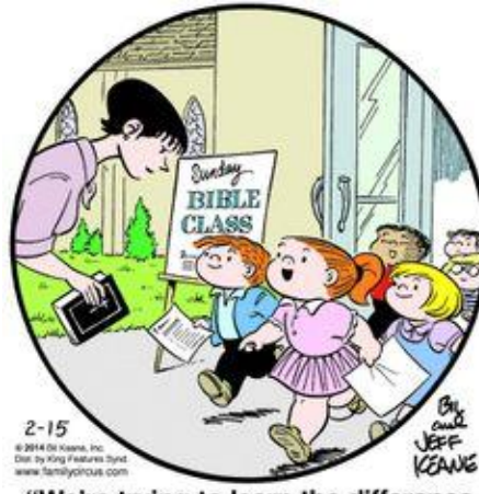
2-15

"Mommy, Santa Claus isn't watching me in the summer, is he?"